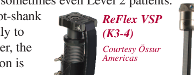
ReFlex VSP (K3-4)