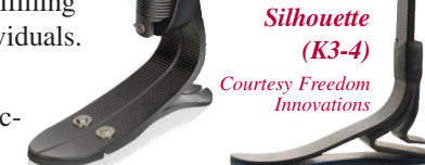
Silhouette (K3-4)