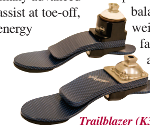
Trailblazer (K3-4)

Level 4: Amputee has the ability or potential for prosthetic ambulation that exceeds basic ambulation skills, exhibiting high impact, stress or energy levels. Typical of the prosthetic demands of the child, active adult or athlete.