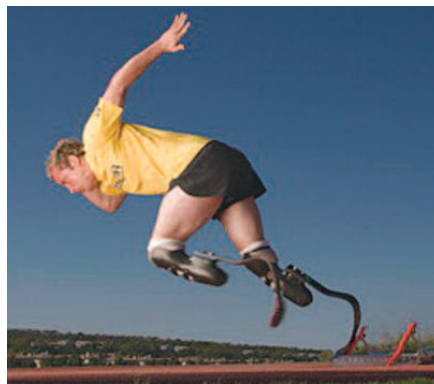
Oscar Pistorius’s speed has launched Olympic-size controversy.

In early 2008, the International Association of Athletics Federations (IAAF), track and field’s governing body, ruled that his prostheses are in fact “technical aids” that give Pistorius a clear advantage over able-bodied runners and therefore he is ineligible to compete in the Olympics.