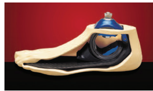
C-Walk Foot (K3)