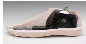
Single-Axis Foot (K1-2)

and thereby help the prescribing physician, patient, caregivers, and others involved in the rehabilitation effort understand the benefits and drawbacks of the various feet under consideration.