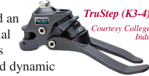
TruStep (K3-4)