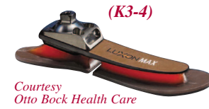
LuXon Max Low Profile (K3-4)