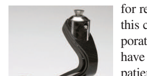
Renegade (K3-4)