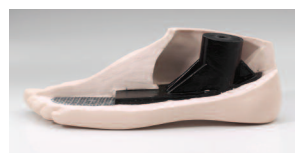
SACH foot (K1-2)

Nevertheless, selecting the “best” foot from the expanding list of contenders can be quite a challenge as time-honored favorites are regularly surpassed in technology, performance, and patient acceptance. It is the prosthetist’s role to remain current on the latest proven products