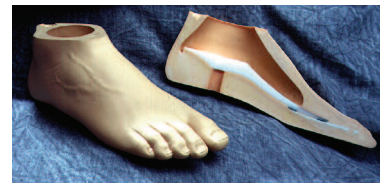
Seattle Lightfoot (K3)