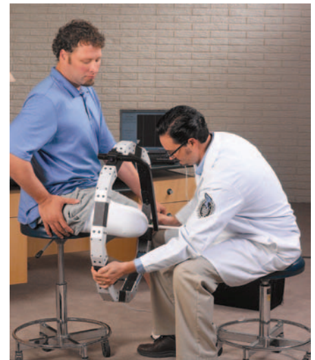
CAD/CAM scanning systems such as the Omega TracerCAD create a precise digital model of the residual limb for socket fabrication.