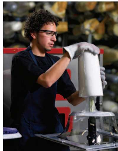
Vacuum forming a socket over mold of a residual limb.

Selecting the most appropriate componentry for a new amputee's specific needs and abilities is an essential part of the prosthetic process. After a careful preparatory phase, the definitive prosthesis is fabricated using more permanent materials and incorporating all knowledge gained to date.