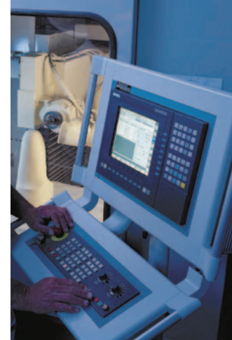
CAD/CAM carver brings digital precision to forming socket molds.

Starting with information from a direct scan or negative cast of the residual limb, CAD/CAM software presents a visual image of the limb from which the prosthetist can design a socket on a monitor, optimizing the overall shape and trimlines and adding build-ups and reliefs as necessary. Finally, the CAD/CAM system feeds the design to a carver, which that creates a positive model over which the shell of the definitive socket can be vacuum-formed.