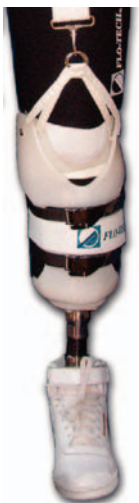
APOPPS post-op system